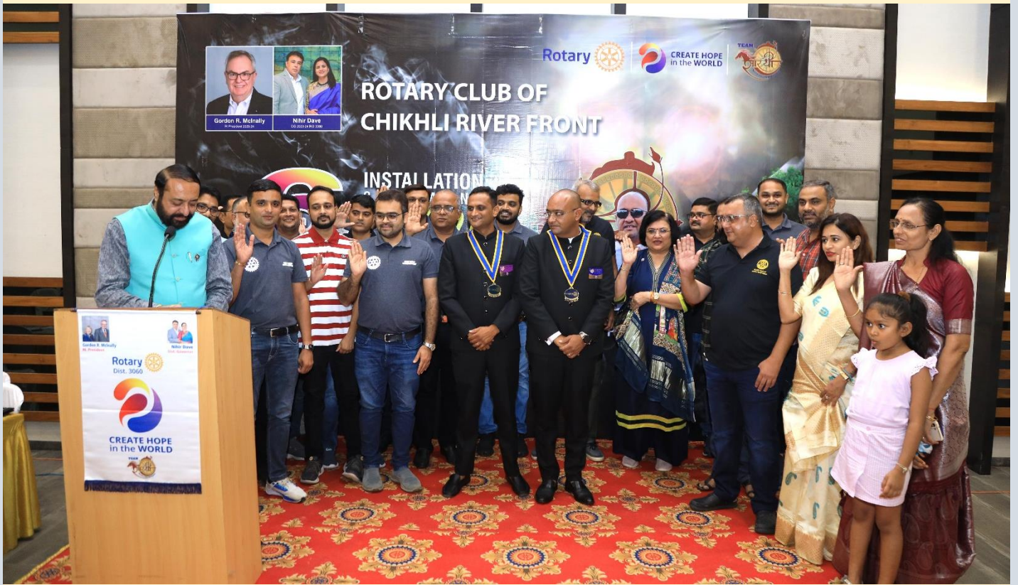
OATH(ABOVE)- GROUP PIC(BELOW)BEST OF LUCK TEAM SAARTHI